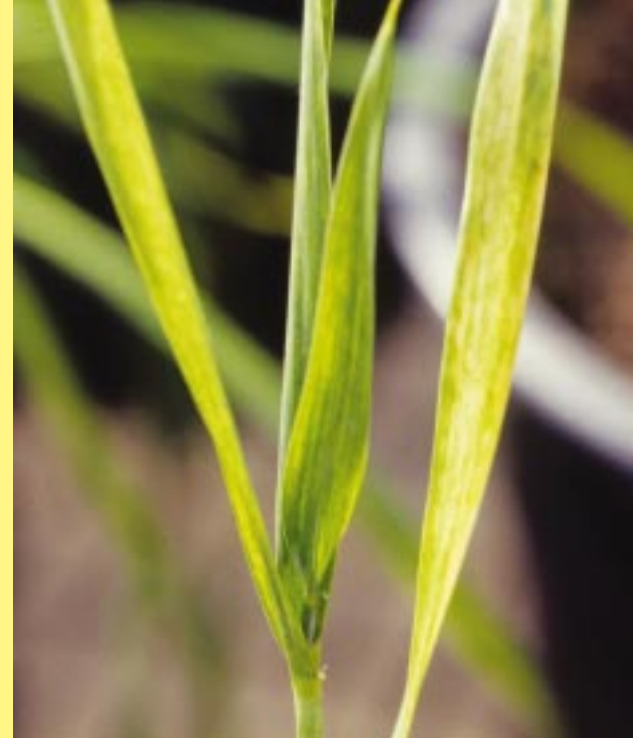
Wheat streak mosaic symptoms in a young wheat plant.

Areas that may be at risk in Australia are those that experience mild, wet summers that enable volunteer cereals and grasses to form a 'green bridge' between the old crop and the new crop. The dry summer and