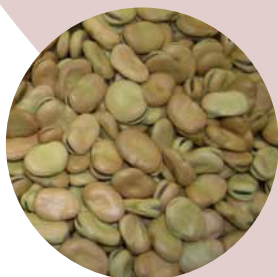
PBA Kareema ®