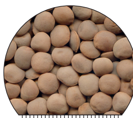
PBA Blitz ®

PBA Blitz ® is a medium-sized red lentil. It has a lens-shaped seed similar, but slightly rounder and significantly larger than Nugget and PBA Flash ® with a grey seed coat. PBA Blitz ® demonstrated similar but generally improved seed milling characteristics compared to Nugget in laboratory testing. Seed size, as measured by 100 seed weight, is generally 15-20% greater than Nugget and it has consistently achieved a higher rate of seed size uniformity in short season environments.