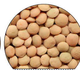
PBA Flash ®