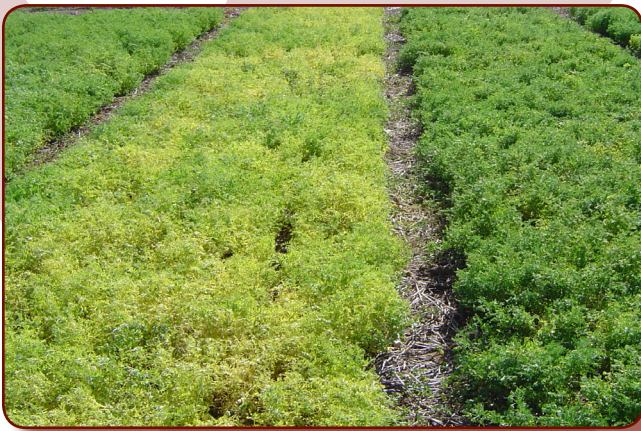
PBA Blitz ® (left) matures earlier than other varieties