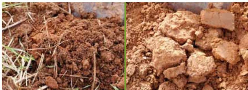
The block clods of the compacted layer following ripping (right) compared to the small friable aggregates in an uncompacted soil (left).