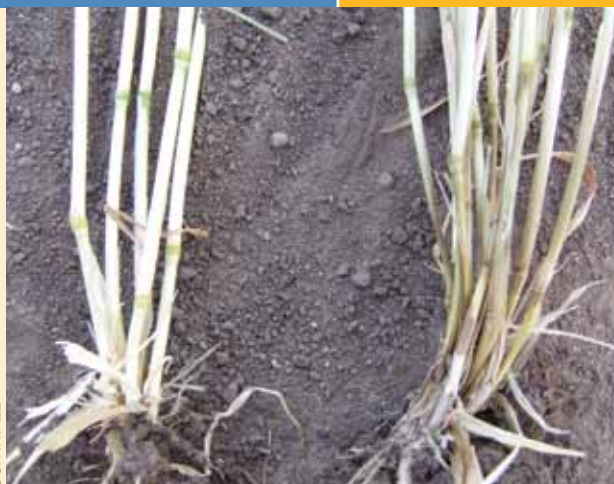
Healthy tillers (left) and severe basal or stem browning (right).