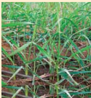
Infection occurs when plants are close to infected plant residues.

When infected plant residues are close to growing plants, crown rot infection can occur. Even minute pieces of residue can cause infection and a paddock with little visible stubble may still have a crown rot risk. Infection is favoured by moderate soil moisture at any time during the season. Infection occurs in the sub-crown internode, crown and/or outer leaf sheaths at the tiller bases. The fungus spreads up the stem during the season, with most inoculum being found near the base of the plant (see Figure 1).